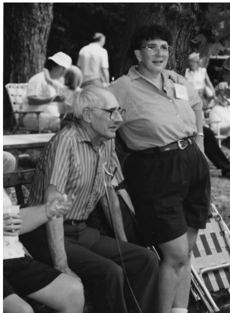
Two reunion attendees enjoying the 1993 reunion at Heimwald Park