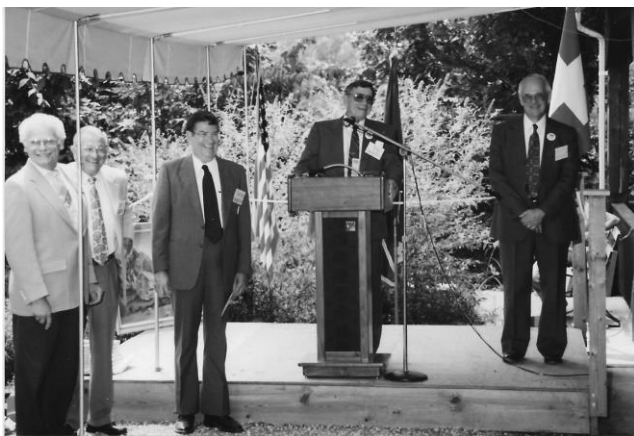
Association directors share a laugh during the 250 th Anniversary Reunion in 1993